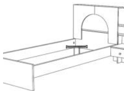
2600 LICH L: 136 x H.: 100 x P. : 218 cm