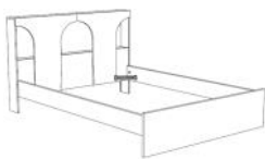
2600 L140 : L: 148 x H.: 100 x P. : 209 cm