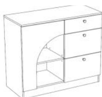
2600 COPT L: 910 x H.: 800 x P. : 398 cm